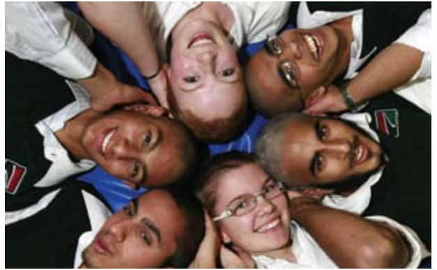
Sim Media Corp.